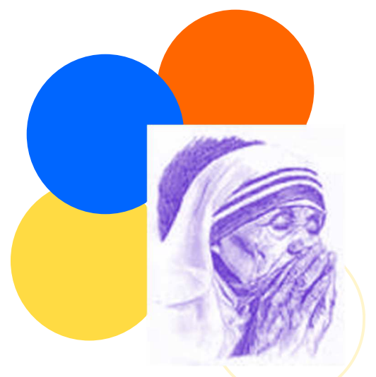
"We cannot all do great things, but we can all do small things with great love." Saint Mother Teresa